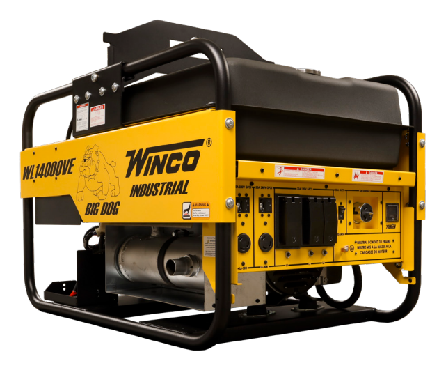
B & S Commercial Vanguard Engine.