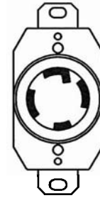
NEMA: L14-30R 125/250V-30A